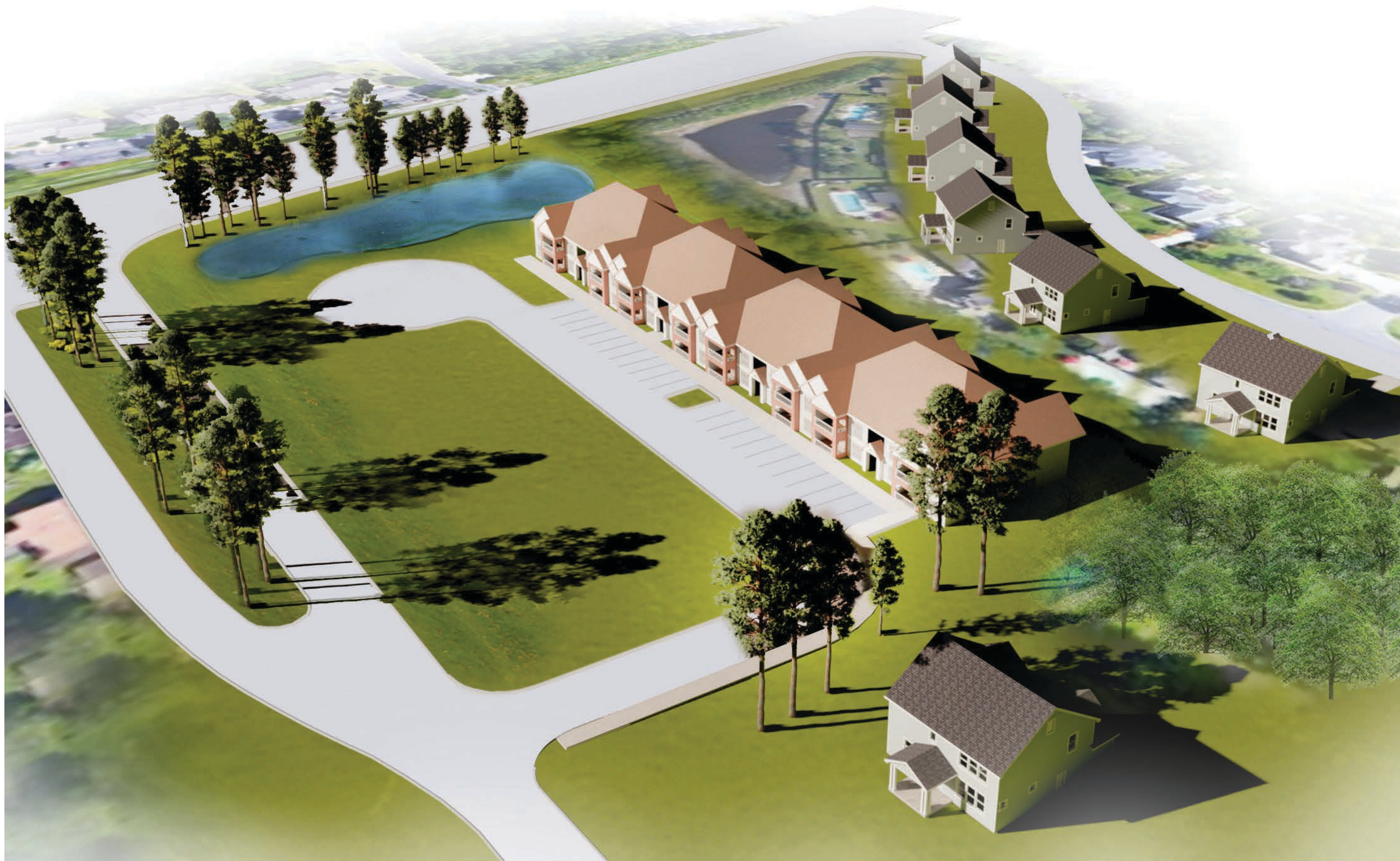
HOLLY GROVE TOWNHOMES PERSPECTIVES: OPTION 1 (BY RIGHT SINGLE FAMILY ATTACHED BUILDING)